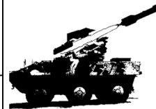
professor of APPLIED SCIENCE

Uni. maintains INVESTMENTS IN APARTHEID state "israel" (Study abroad programs, Boeing, Hewlett-Packard, and Northrop Grumman) It funds ONGOING GENOCIDE in Gaza.