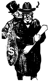
Architect of Academic Agenda