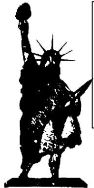
professor of THEORY

UNC inscribes the values of CITIZENSHIP, CIVIL DISCOURSE, & FREEDOM OF SPEECH into university fabric (see: SCiLL), the official MYTH, which covers up the CORPORATE, FASCIST, & COLONIALIST REALITY.